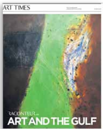
Bahrain art scene by RACONTEUR MEDIA distributed by The Times, UK