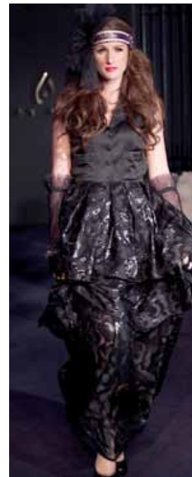
Noon By Noor debuts with Fall/Winter 2011-12 Collection